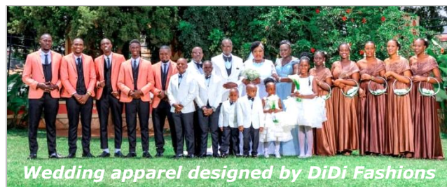
Wedding apparel designed by DiDi Fashions

He tailors both men's and women's fashions, specializing in wedding parties.