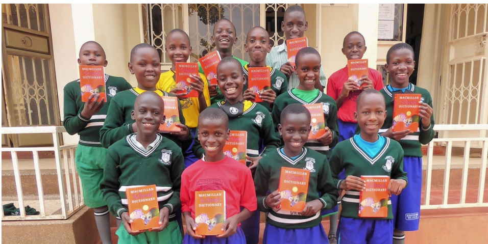
New dictionaries for our fifth grade students

We welcome donations of any amount. You can also help by organizing a fundraising event in your church, school, office, Sunday School, or organization on behalf of the children of Uganda.