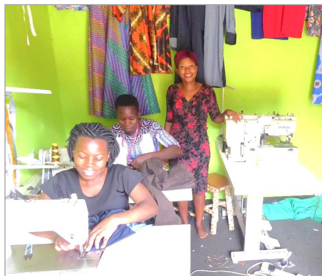
Divine Garments workshop

She now has three employees and six sewing machines, including specialized machines for buttons, buttonholes, and overlock stitching used for edging and seaming. Her workshop produces menswear, ladieswear, overalls, bridal, medical, corporate wear, and school uniforms. Her customers range from Kampala to western Uganda, Busia on the Kenyan border, and even into South Sudan.